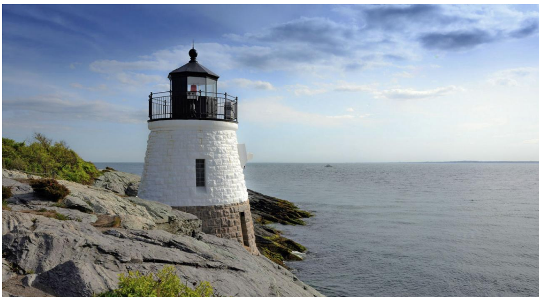
Castle Hill Lighthouse, Rhode Island.