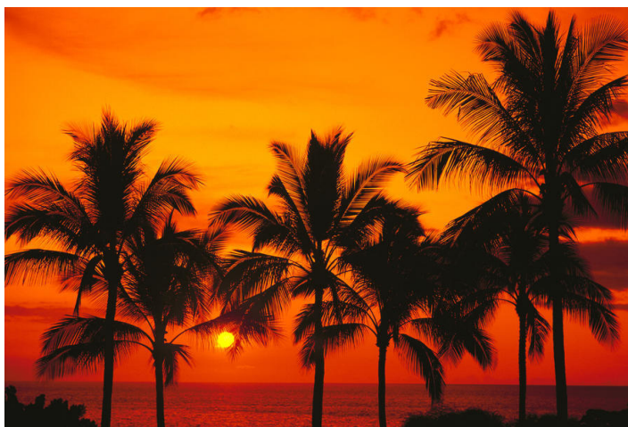
Beach at San Diego, California