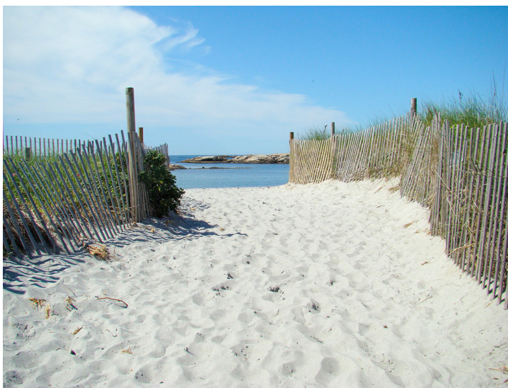
Beach at Providence, Rhode Island.

Twelve Students from the San Diego French American School (SDFAS) in exchange with twelve students from the French American School of Rhode Island (FASRI). Four students from each school’s 6th, 7th, and 8th grade classes.